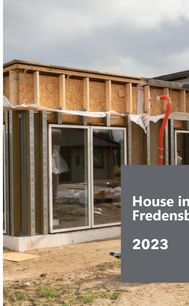
House in Fredensborg 2023