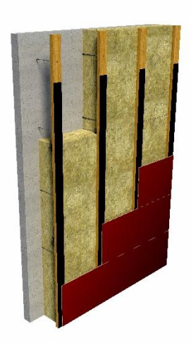
Figure 1: REDAir® FLEX system overview. The wall and cladding panels are not part of the REDAir® product offering and included only for illustration. purposes.

The REDAir® system consists of ROCKWOOL® stone wool batts that are currently produced in Doense, Denmark. The system is currently available in Denmark, Sweden and Norway.