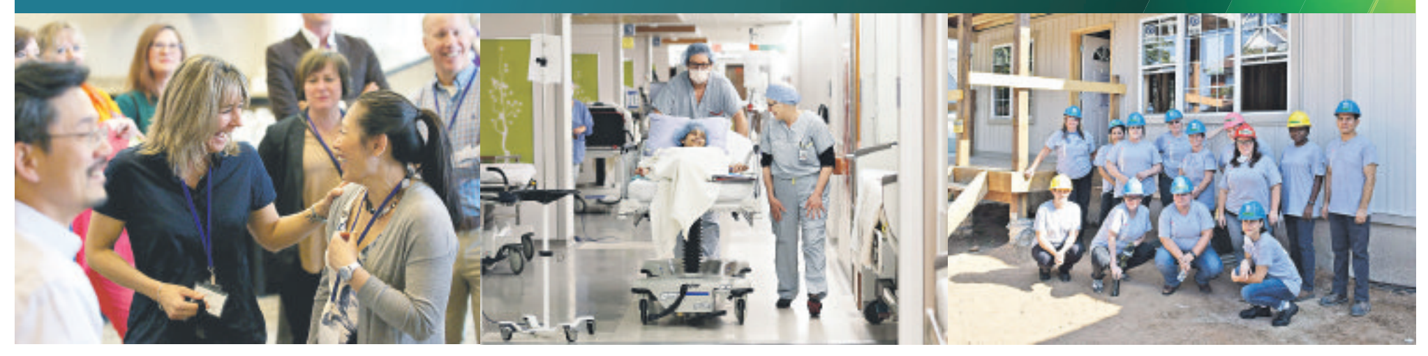
Boehringer Ingelheim (Canada) employees at the company's Value Through Innovation Day.

On the way to surgery at St. Joseph's Healthcare Hamilton.