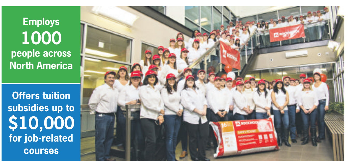
Employees at ROCKWOOL celebrate the company's 80th Anniversary in 2017.

"As a global company with strong community values, we