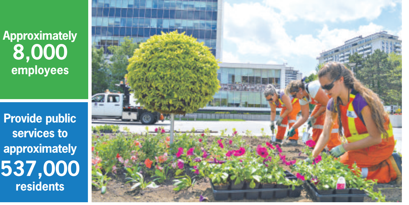
Dedicated staff from the Public Works Horticultural division work hard to brighten up our spaces.

and a strong focus on our people & performance. It is through the hard work of our employees and Council, community partners and residents that we will achieve our vision and advance the priorities of our strategic plan.