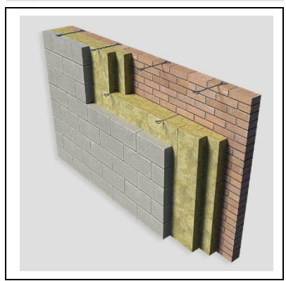
Figure 4 Multi layering