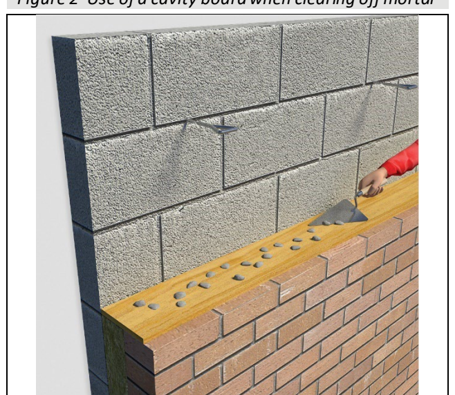
Figure 2 Use of a cavity board when clearing off mortar

14.8 Before installing each course of slabs, excess mortar must be removed from the inside face of the leading leaf, and mortar droppings cleaned from the exposed edges of the slabs. This is made easier using a cavity board (Figure 2). This sequence should be maintained progressively until it reaches the wall plate or cavity tray. It is important for the insulation to be installed to the highest level of each wall with all areas of the wall insulated (see section 13.5).