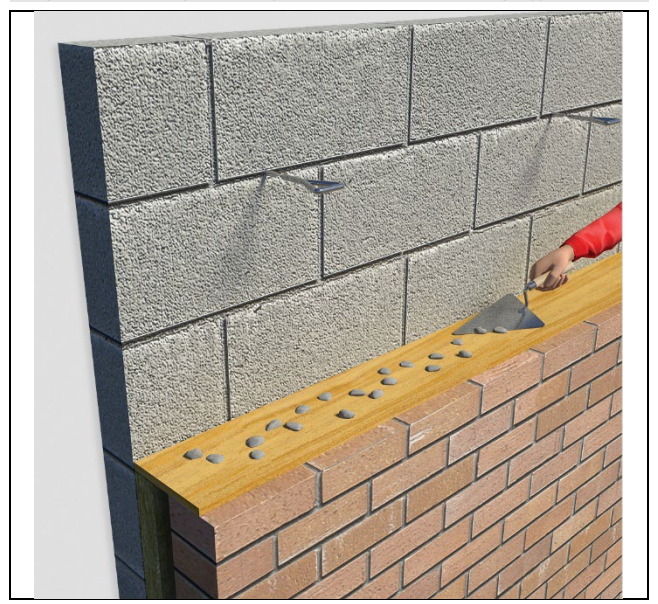
Figure 2 Use of a cavity board when clearing off mortar