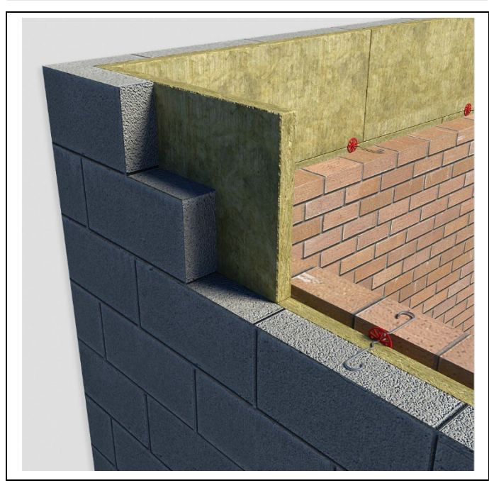
Figure 3 Slabs at corner detail

14.10 At corner joints, edges must be cut accurately to ensure close butting (see Figure 3).