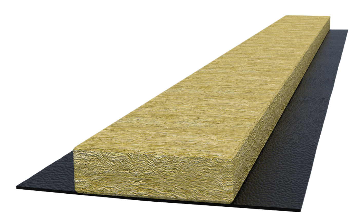
Figure 1 - RockClose Insulated DPC